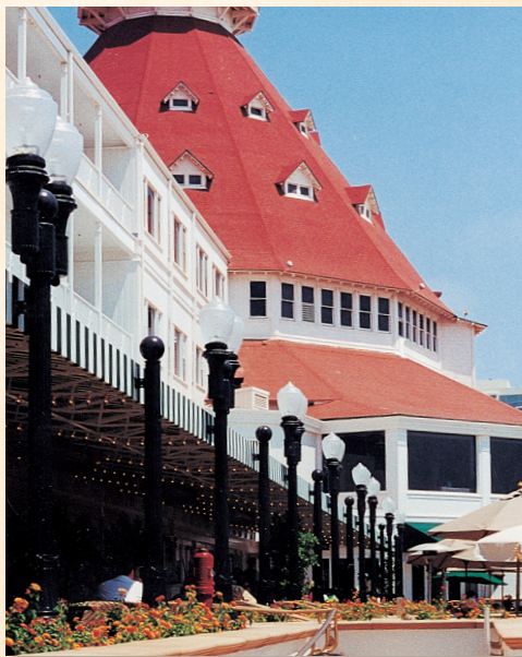
Pictured clockwise from above: Coronado, CA; Council Bluffs, IA; Everett, WA; Needham, MA, Issaquah, WA; Redmond, WA; and Canyonville, OR