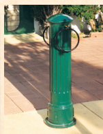
Pedestrian & Traffic Bollards & Infrastructure