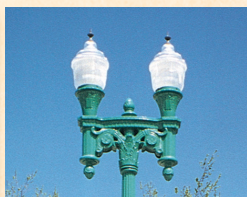
Versatile & Interchangeable Bases, Poles, Arms & Luminaires