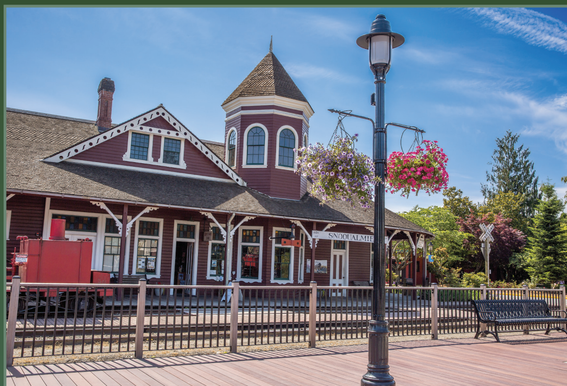
Pictured above: Snoqualmie, WA Pictured on cover: Roseburg, OR; Lodi, CA

VISCO Exterior Lighting Components Enhance Traffic & Pedestrian Mobility, Streetscape Safety and Architectural Continuity