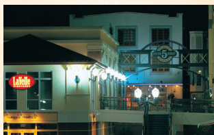
Ornamental and Contemporary Fixtures & Standards

Today, VISCO is recognized by architects and planners worldwide for its wide variety of handsome, well-crafted and reliable traffic and streetscape products.